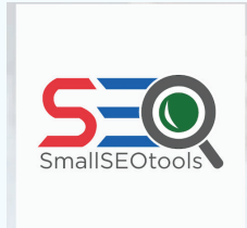
Small SEO Tools